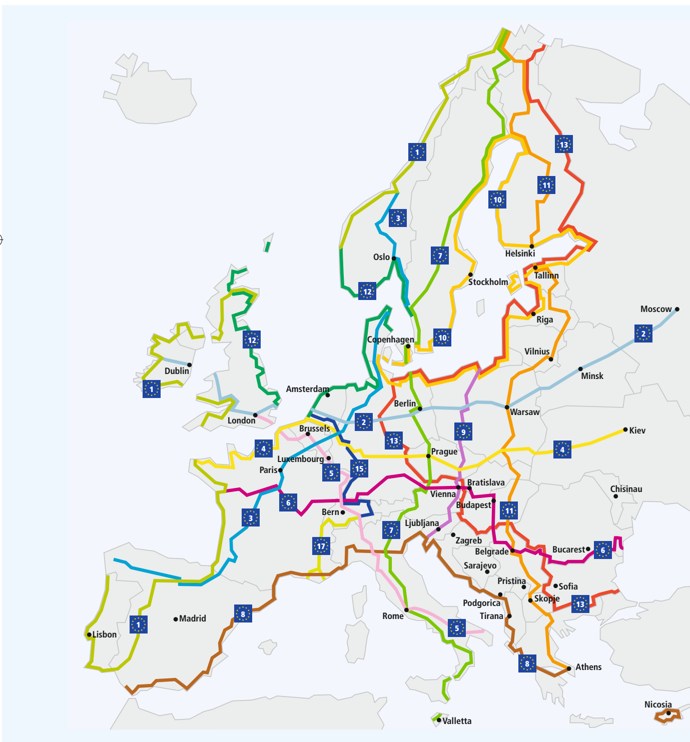
EuroVelo, Signing of EuroVelo cycle routes